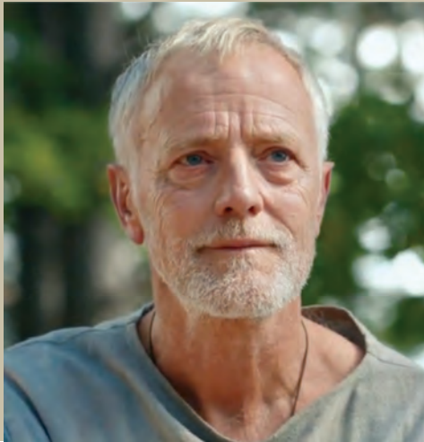
Lars Simonsen (Bron/The Bridge, 2013)