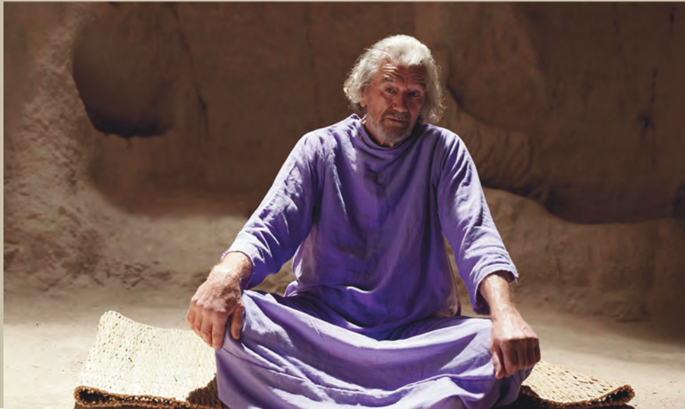
Clive Russett ( Game of Thrones , 2016)